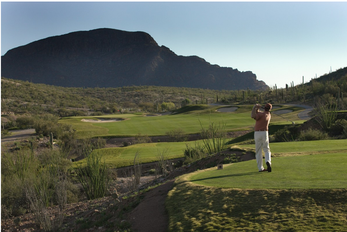
Golfer Teeing Off