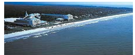
The ocean view of the Westin Resort

A family business pre-conference is being planned. More information will be forthcoming about the workshop.